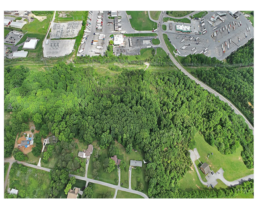
Watt Road on Right Side, Travelcenter Truckstop at Top