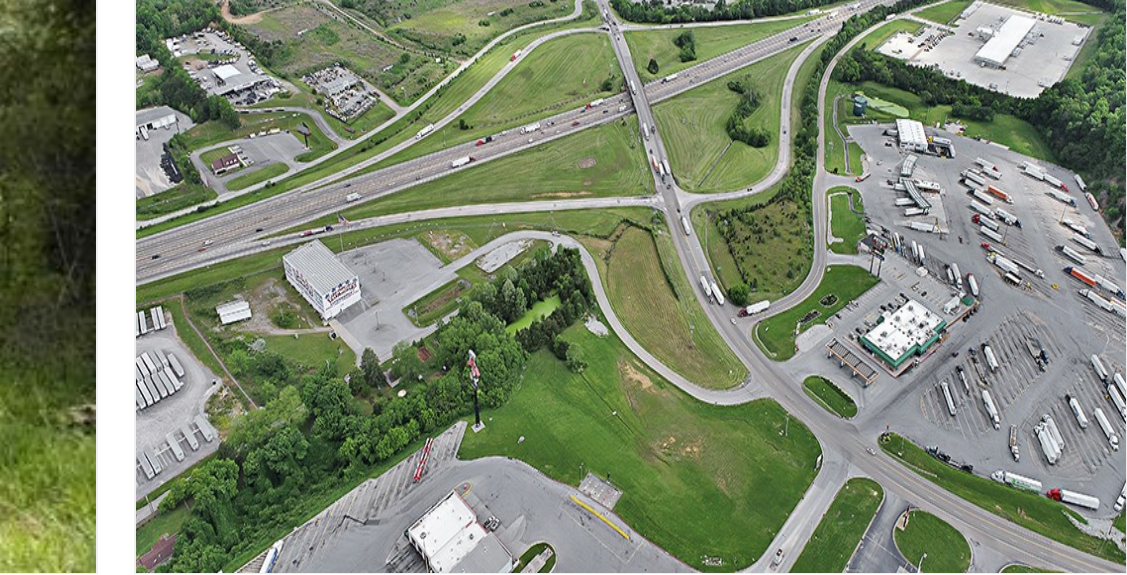
View West from Watt Road