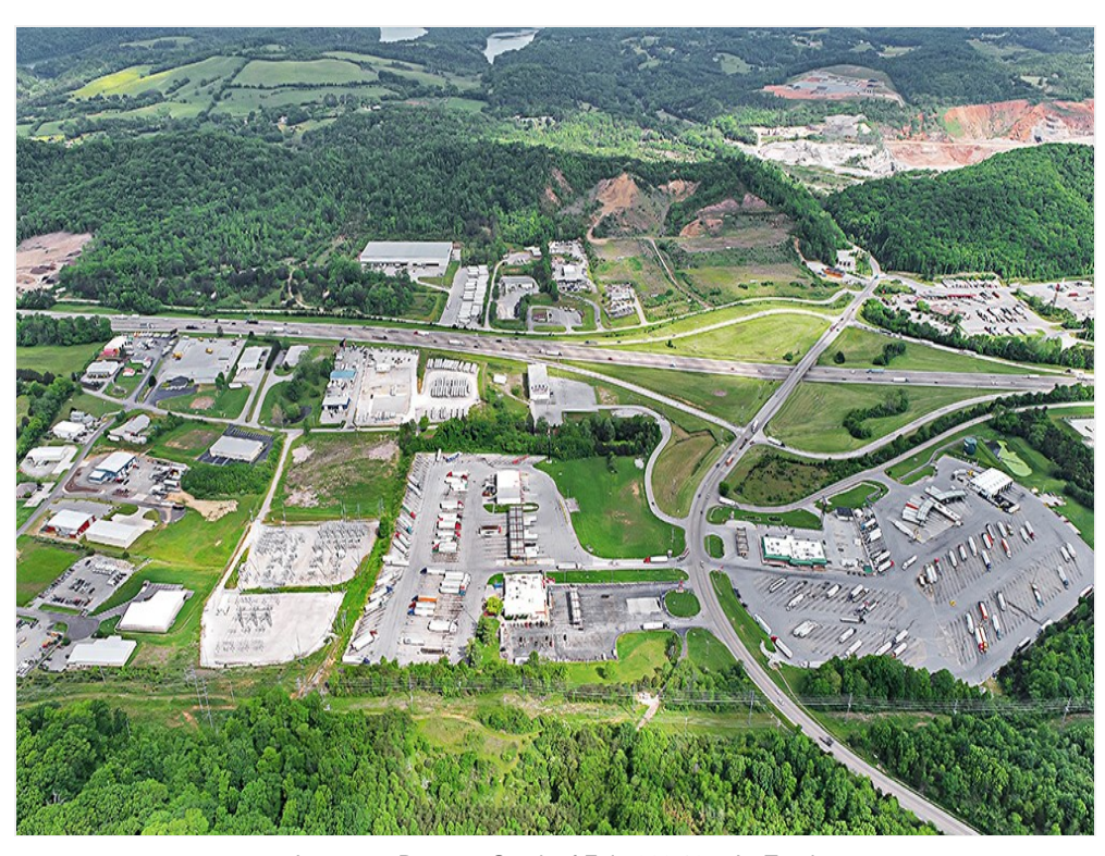
Interstate Property South of Exit#369 12.7 Ac Total